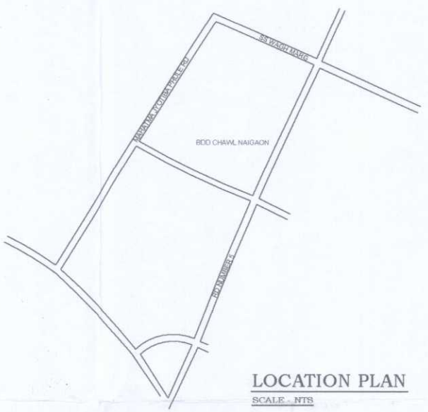
LOCATION PLAN SCALE: 1:1000